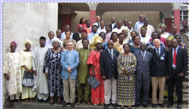
African Participants in the Conjugal Love Course

The useful instructions about how to moderate a case, as well as the example given by moderating three cases will serve as a launching pad for these courses not only in Nigeria but at least in four other African countries.