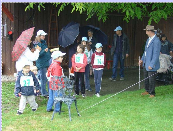
Some of the children who participated in the Children Olympics

Forty families and Forty-eight children attended this yearly activity organized by the FEC in Zurich.