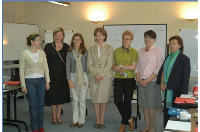
The women of Poland, Belgium and Spain in charge of G2

At the beginning of June there was a meeting in Brussels for the Grundtvig 2. In this project the partners are Poland, Belgium and Spain. The aim of the education program they are elaborating is to improve the communication and relationships between parents, teachers and pre-adolescents.