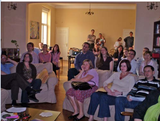
30 Croatian participants during the explanations