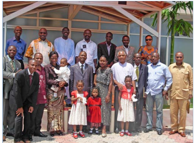
General Assembly in Cameroun where this project was supported

The Family Watch, which was presented during the last congress in Rome, has gained much strength in these last months and that's why we have seen fit to encourage them to reinforce their own identity with legal and functional autonomy, although in close contact with IFFD.