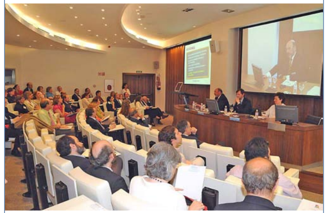
Meeting room during the launching of the asociation on its own

It's highly desirable to provide this think tank with an international advisory council. That's why we ask you to think and send us the name of a trusted person of your environment who could be part of it. We have already received candidates from Cameroun, Argentina and Ecuador. We look forward to your proposals.